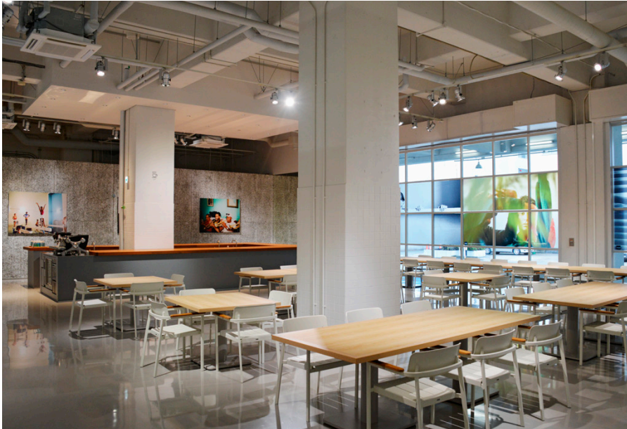
The rooms at the "PORT" are unusually spacious and airy for urban Tokyo standards, with sumptuous interior decoration.

exhibitions and events. Mr Sasaki explains how the images produced by inkjet technology tend to be grainy. "But not with Nyala," he states. In addition to CMYK the printer is equipped with light magenta, light cyan and light black. Using light colours helps to render the smoothest gradients and finest hues. Furthermore, amana had their Nyala equipped with white and varnish as well as a roll to roll option. Thus they can process any material and create special effects, which again is in line with their artistic approach. The substrates commonly used range from acrylic glass, banners and paper to canvas and backlit textiles. Of course, the team is keen to experiment with any other material.